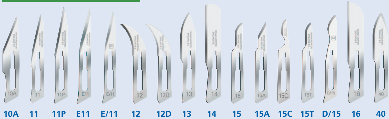
10A 11 11P E11 E/11 12 12D 13 14 15 15A 15C 15T D/15 16 40